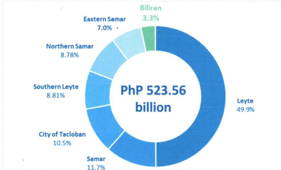
Figure 2. Gross Domestic Product, by Province/HUC In Terms of Share to GRDP (in Percent) At Constant 2018 Prices, 2023

Note: Details may not add up due to rounding