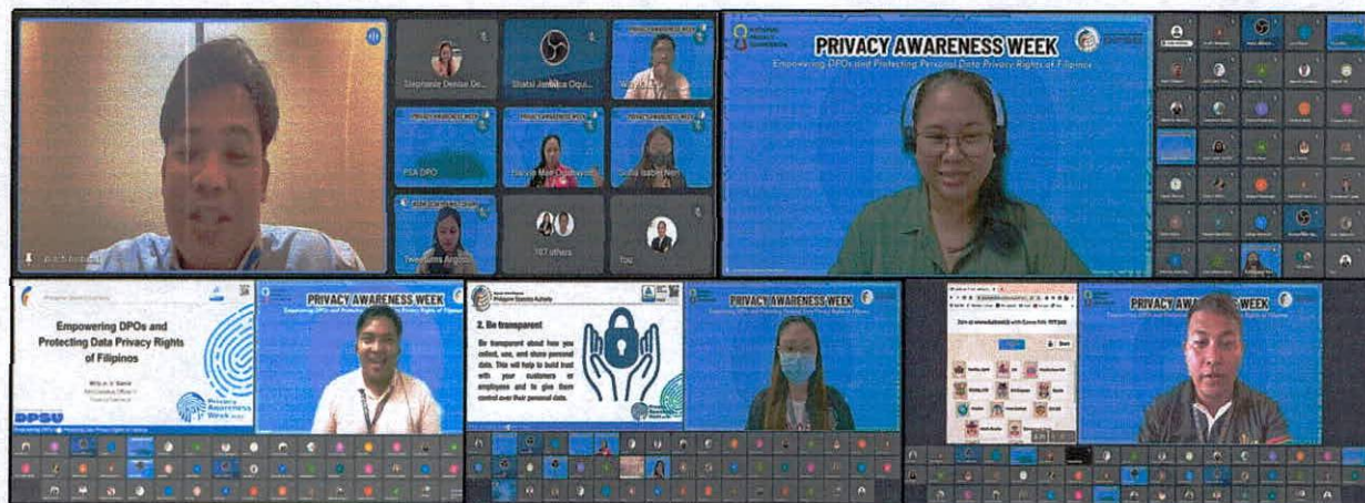
Captured during the short program of Privacy Awareness Week held on 26 May 2023 through an online platform.