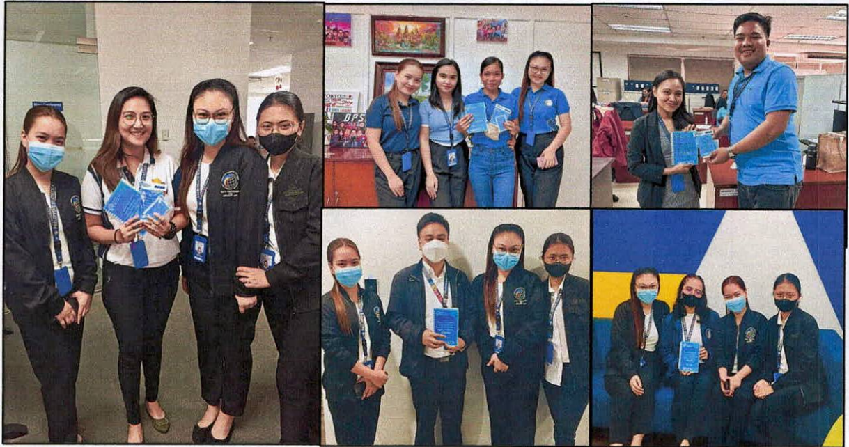
Distribution of prizes to the top five (5) winners in the Kahoot Game.

The Philippine Statistics Authority's ONS-Legal Service Data Protection and Security Unit (DPSU) led this year's celebration of Privacy Awareness Week held from 22 to 26 of May 2023.