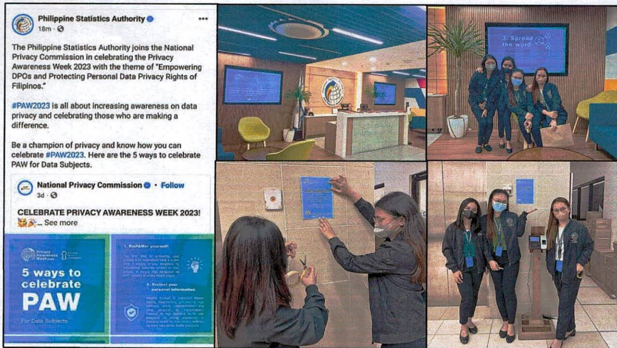
The Data Protection and Security Unit (DPSU) leads the posting of Privacy Awareness Week bulletin, videos, and Facebook updates for awareness purposes.

Date of Release: 01 June 2023 Reference No. 2023-001