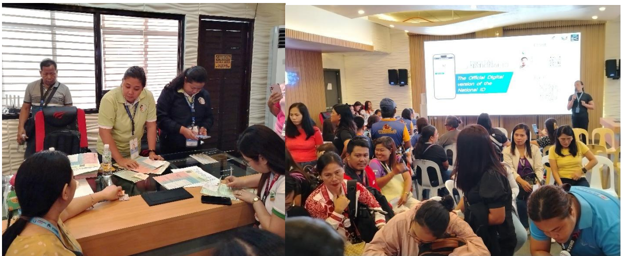
Civil Registry System (CRS) Mobile team accepting and processing requests for Civil Registry Documents in Security Paper (SecPa)