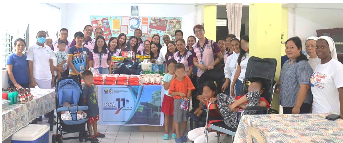
PSA Eastern Samar personnel with the children, sisters and staff of Sisters Servants of the Visitation Foundation, Inc.

Date of Release: 19 September 2024 Reference No. PR-2024-0826-19