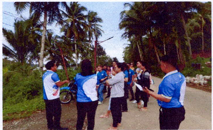
Conduct of Field Practice in Brgy. Calingatngan, Borongan City, spearheaded by PSO Eastern Samar POPCEN-CBMS Team together with the Map Data Collector, Team Supervisor, Map Data Processor and Map Data Reviewer