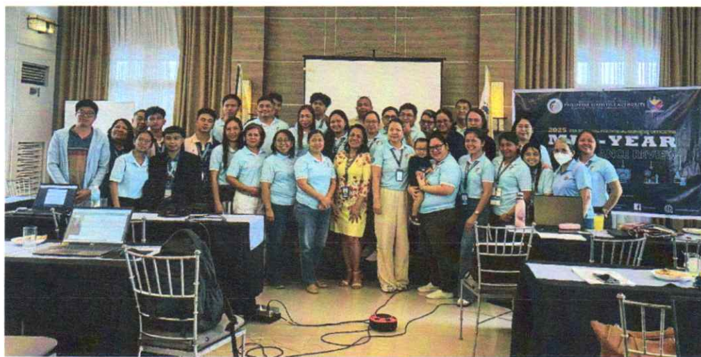
PSA RSSO 8 officials and employees during the 2025 RSSO 8 Mid-Year Performance Review.

Date of Release: 23 July 2025 Reference No. PR 2025-07-0800-48