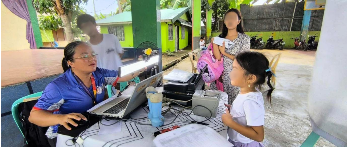
National ID Registration at Lonoy Integrated School, Brgy. Lonoy, Calbayog City, Samar

Date of Release: 30 June 2025 Reference No. PR25-06-0860-18