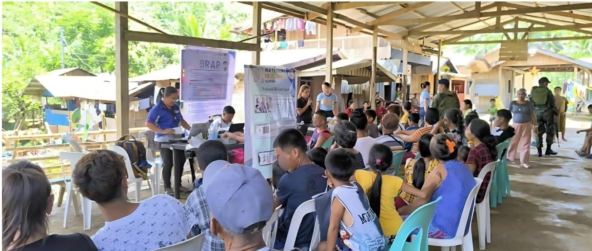
BRAP and National ID Mobile Registration at Brgy. Helino, Calbayog, City, Samar

Date of Release: 17 June 2025 Reference No. PR25-06-0860-13