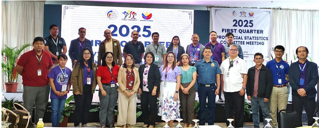
Photo opportunity of PSC Members after the 1st Quarter PSC meeting at 3 rd Floor Convention Center, Samar State University, City of Catbalogan on 26 March 2025.

Date of Release: 28 March 2025 Reference No.: PR25-03-0860- 05