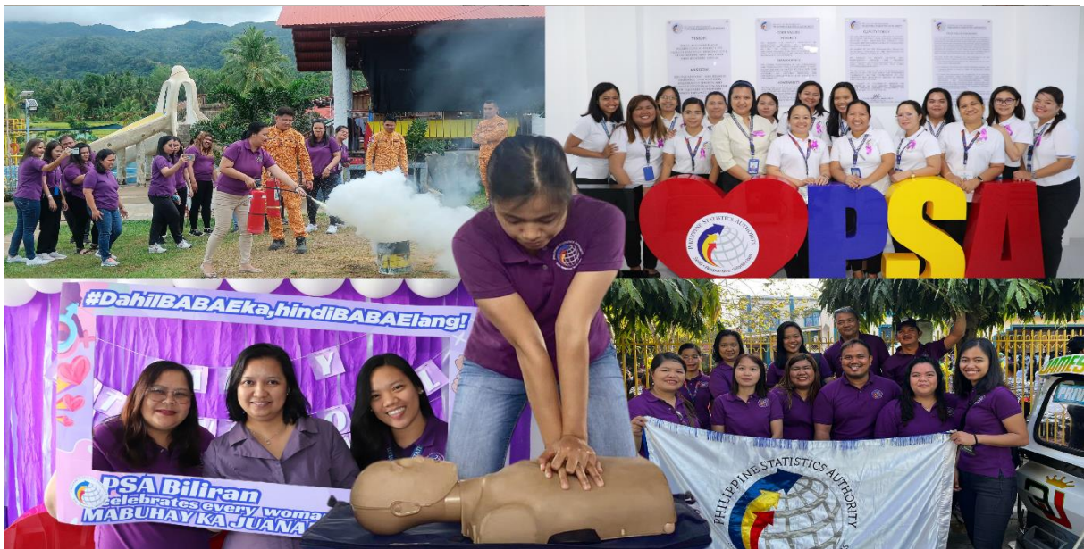
Photos taken during the 2024 National Women's Month Activities in the Province of Biliran

The Philippine Statistics Authority (PSA) - Biliran Provincial Statistical Office (PSO) celebrated the 2024 National Women's Month (NWM) with the theme " Lipunang Patas sa Bagong Pilipinas: Kakayahan ng Kababaihan, Patutunayan! "