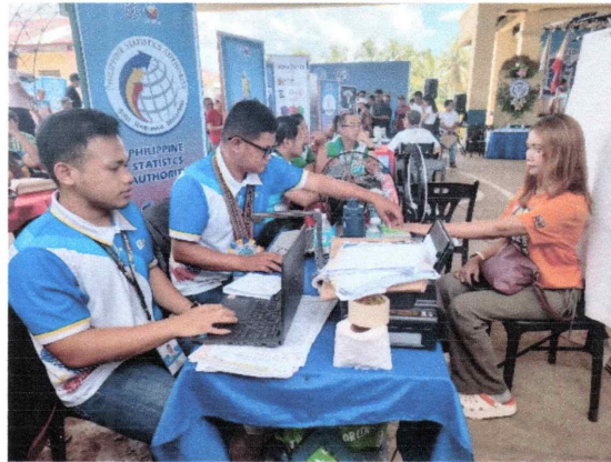
In photo: RKO captures the fingerprints of a registrant during the biometric registration process.