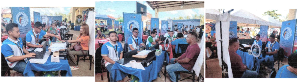
NID Team in action during TESDA Tech-Voc Day in Dolores, E. Samar.

Date of Release: 11 August 2025 Reference No. PR-2025-0826-31