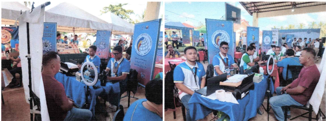
In the photo: NID registration team during the registration process.