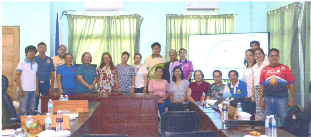
PSA Staff with the personnel and officials of LGU Giporlos

Date of Release: 01 August 2025 Reference No.: PR-2025-0826-26