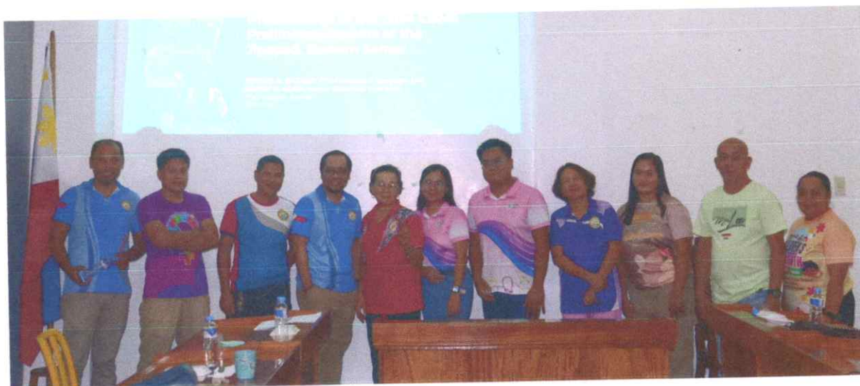
PSA Staff with the personnel and officials of LGU Jipapad

18 July 2025 – Jipapad, Eastern Samar. As the nationwide rollout of the 2024 CBMS Preliminary Results presentations continues, PSA Eastern Samar marked its fourth successful event in collaboration with the Local Government Unit of Jipapad on the morning of 18 July 2025, held at the Conference Hall of the municipality.