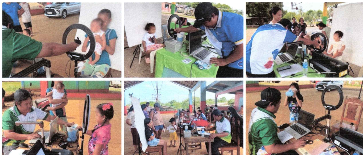
NID Team in action during BRAP and National ID Registration in Salcedo, E. Samar.