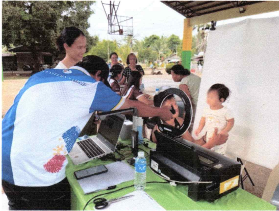
RA captures the front-facing photo of a child registrant during the biometric registration process.