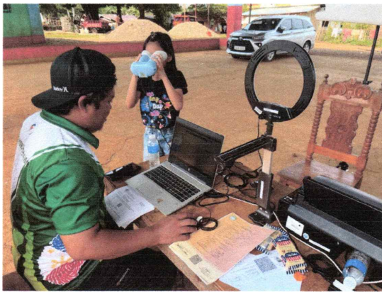
RA captures a child registrant's fingerprints and iris during biometric registration.