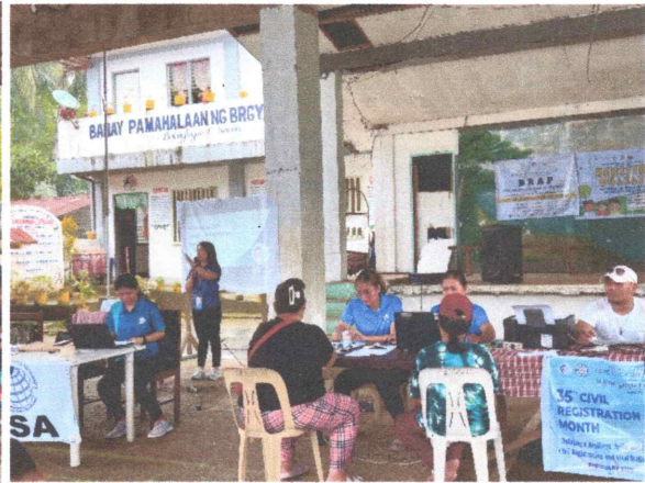
BRAP and National ID registration ongoing, facilitated by the teams.