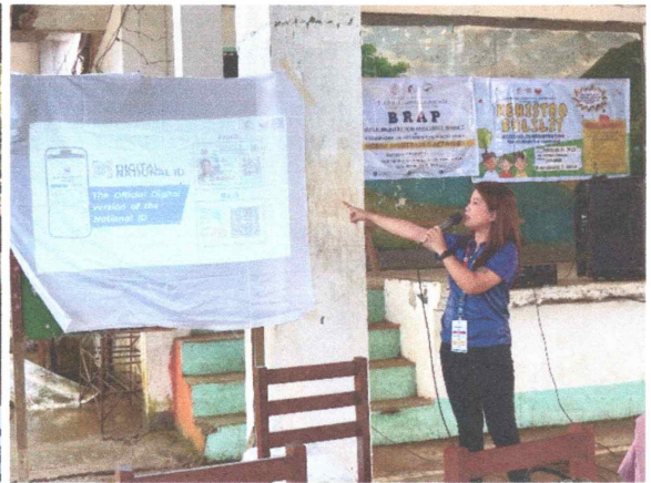
Informative session on civil registration and the National ID system, led by PSA staff.