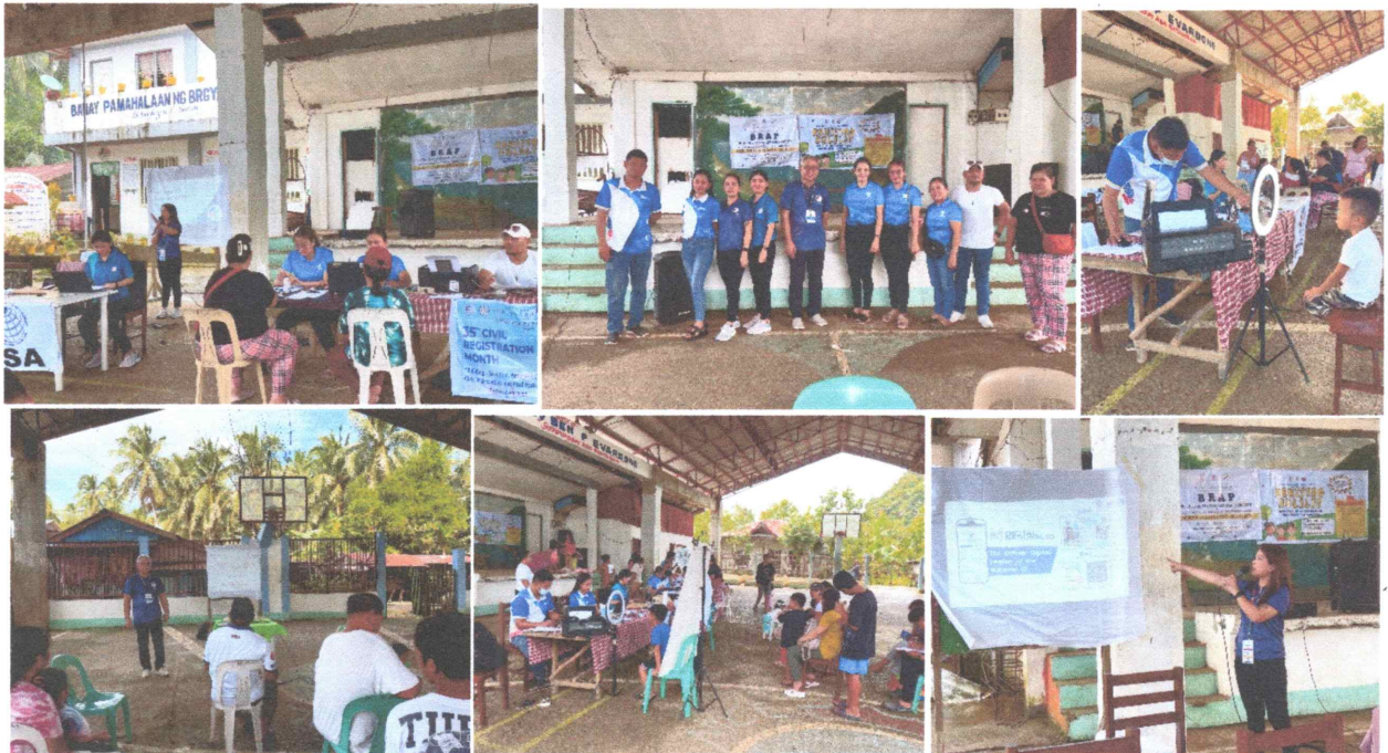
The National ID registration team and BRAP, together with LCR staff, facilitate residents of Brgy, Caisawan, Balangkayan in securing essential documents.

Date of Release: 12 February 2025 Reference No. PR-2025-0826-03