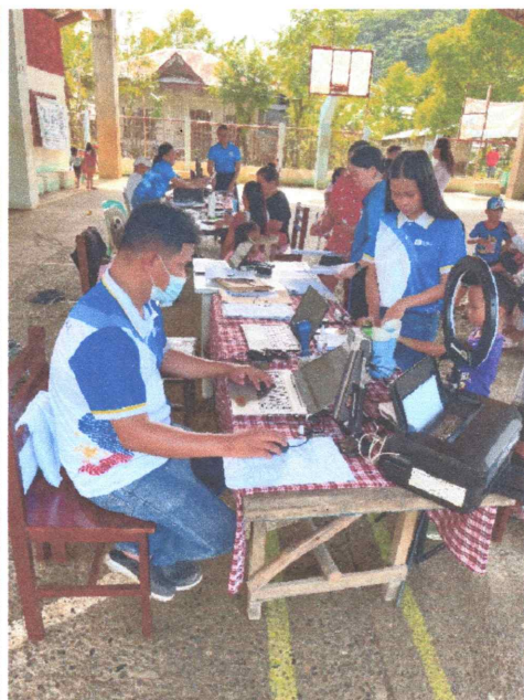
Capturing front-facing photos and fingerprints during the National ID registration process