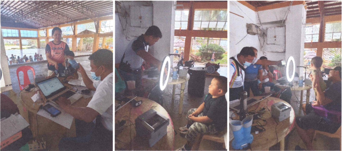
The PhilSys registration team facilitating the registration process during the Rehistro Bullit campaign in Jipapad, Eastern Samar