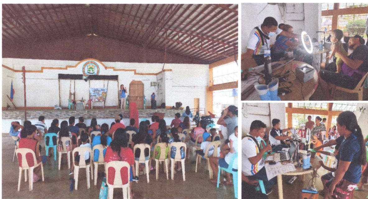
The PhilSys registration team facilitating the registration process during the Rehistro Bulilit campaign in Jipapad, E. Samar

05 December 2024 – JIPAPAD, EASTERN SAMAR – The Rehistro Bulilit campaign was successfully launched yesterday, December 5, 2024, at the Municipal Covered Court in Jipapad. This initiative aims to register children aged 1 to 4 years old who have not yet been included in the Philippine Identification System (PhilSys). By bringing registration services directly to local communities, the campaign makes it easier for families, particularly in remote areas, to access essential government services without the need to travel long distances. The ongoing rollout across the province ensures that more children are properly registered and included in the national ID system.