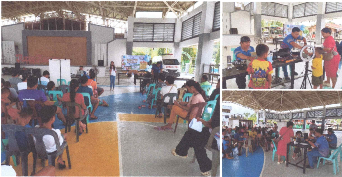
The PhilSys registration team facilitating the registration process during the Rehistro Bulilit campaign in Maslog, Eastern Samar

Date of Release: 02 December 2024 Reference No. PR-2024-0826-28