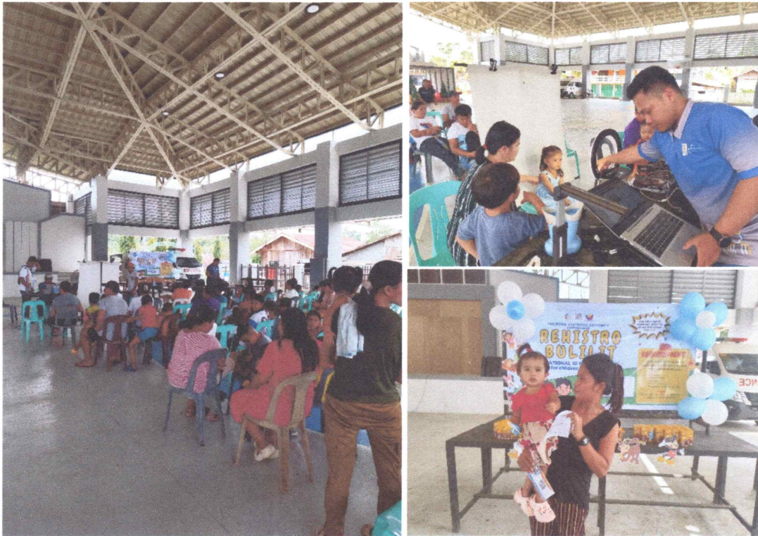
The PhilSys registration team facilitating the registration process during the Rehistro Bulilit campaign in Maslog, Eastern Samar