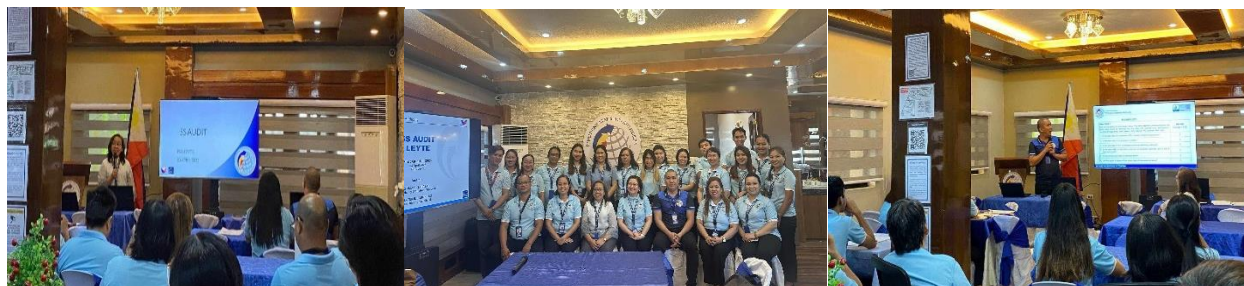
Photos taken during the PSA Leyte 5S Audit

Tacloban City, Philippines - The Philippine Statistics Authority (PSA) – Leyte Provincial Statistical Office has successfully conducted a 5S Audit on 03 April 2025 as part of its commitment to continuous improvement and workplace efficiency. The audit aimed to assess the implementation of the 5S methodology, a globally recognized system for workplace organization that enhances productivity, safety, and efficiency.