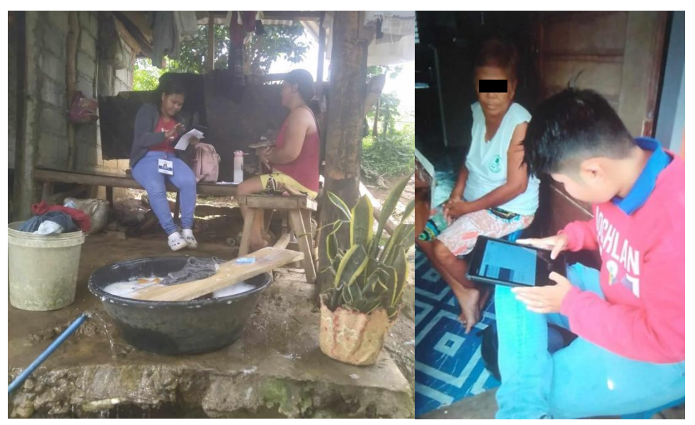
Photo taken during the enumeration of 2023 Household Energy Consumption Survey on 02 July at Brgy. Villa Caneja, Naval, Biliran Province

Date of Release: 16 July 2024 Reference Number: 24PR08078-36