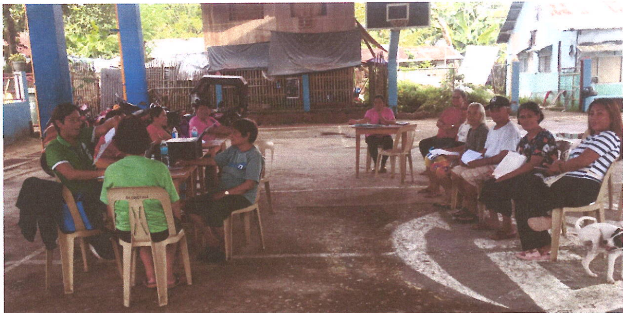
Photo taken during the Mobile Civil Registration at Brgy. Cristina, Calubian, Leyte, last 26 June 2025

JULY 2025 – PROVINCE OF LEYTE. With the continuing implementation of the Birth Registration Assistance Project (BRAP) which is one of the flagship projects of the Philippine Statistics Authority (PSA), the PSA Leyte BRAP Team joined the Local Civil Registry Office (LCRO) of Calubian, Leyte in the conduct of Mobile Civil Registration at Brgy. Cristina, Calubian, Leyte, last 26 June 2025, where they were able to prepare a total of 21 Certificates of Live Birth in preparation of registering their births before the LCRO of their place of birth.