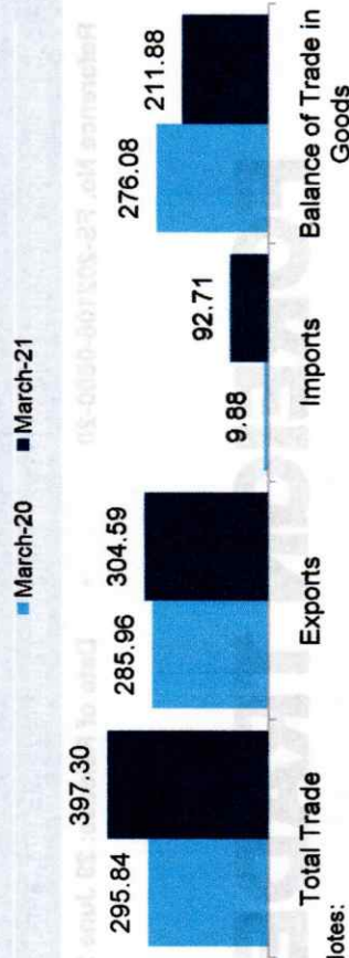
Figure 1. Foreign Trade Statistics, Region VIII: March 2020 and March 2021 P (Free on Board Value in Million USD)

Notes: P- Preliminary data Details may not add up to totals due to rounding.